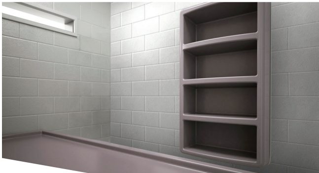
Four Shelf Locker EN 6000-8