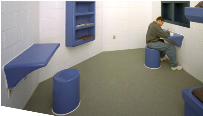
Wall Desk EN 6000-9 Shown with Round Stool EN 6000 - 11