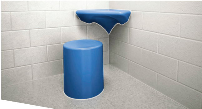
Round Stool EN 6000-11 Shown with Corner Desk EN 6000-16