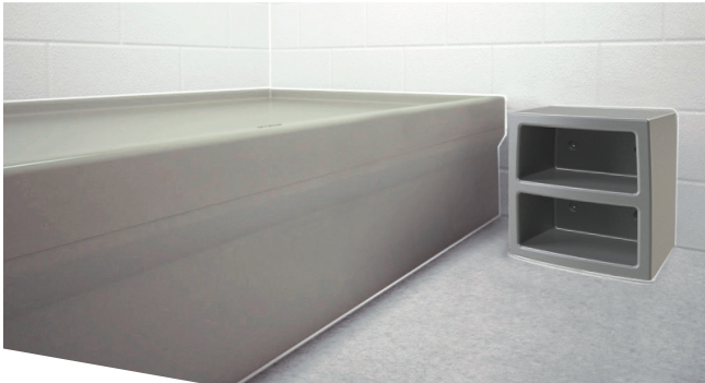
Nightstand ES 4000-17 Shown with Herculite Bed EN 6000-1