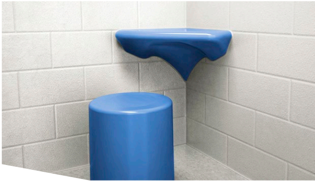
Corner Desk EN 6000-16 Shown with Round Stool EN 6000 - 11