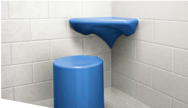
Corner Desk EN 6000-16 Shown with Round Stool EN 6000 - 11