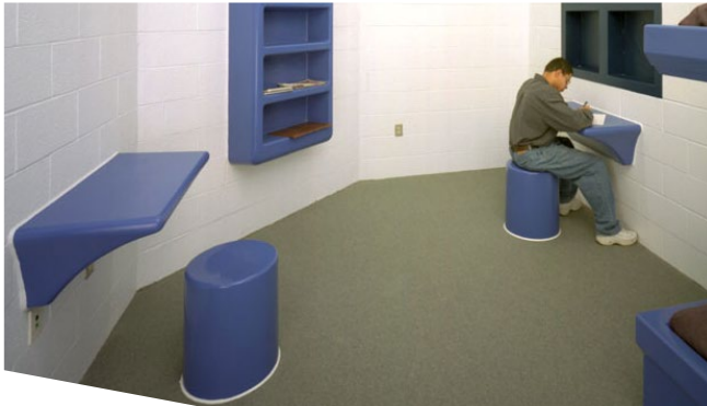
Wall Desk EN 6000-9 Shown with Round Stool EN 6000 - 11